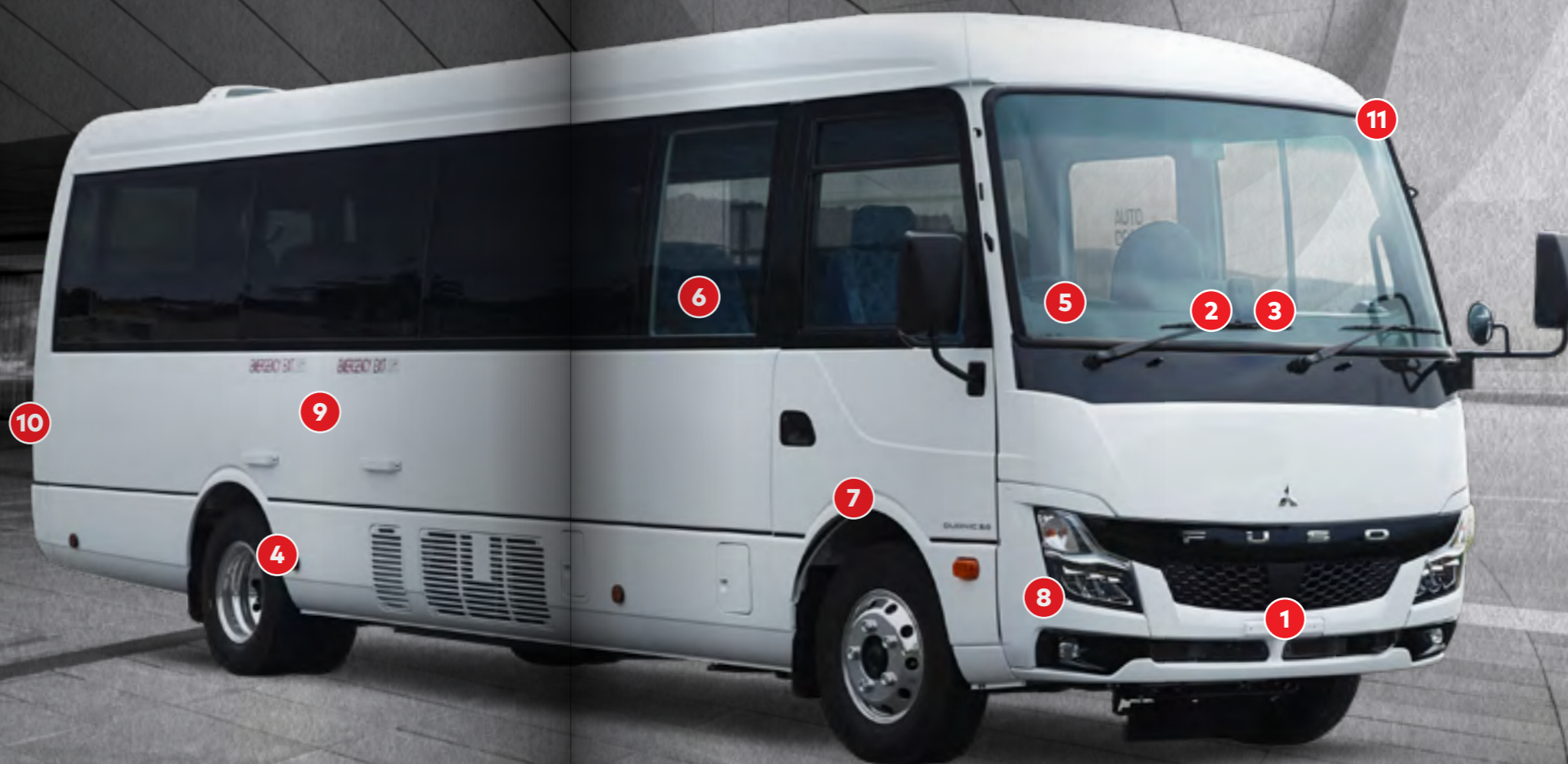
Deluxe model shown